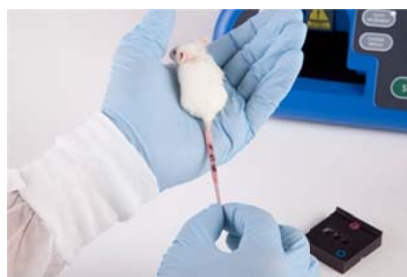
Figure 3-19 Tattoo Complete

When finished, clean the Labstamp components as needed, and proceed with the next mouse, See Cleaning & Maintenance below for detailed instruction on cleaning the System.