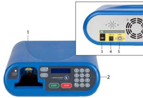
Figure 2-3 Applicator Machine