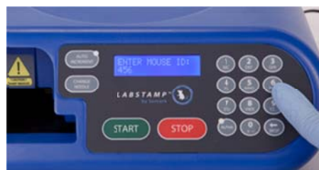
Figure 3-16 Entering the ID