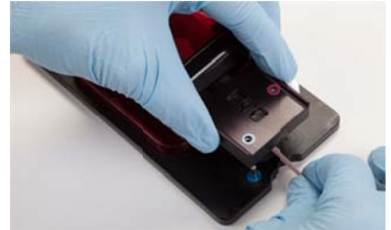
Figure 3-13 Tail Cover