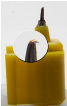
Figure 4-1 J-Hooked Needle