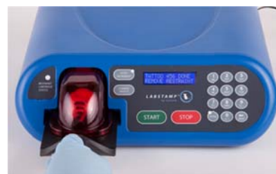
Figure 3-18 Removing the Restraint