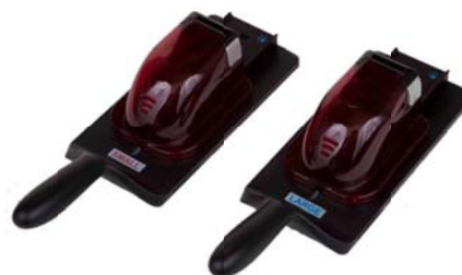
Figure 3-3 Restraint Cartridges