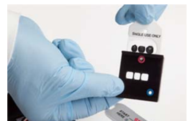
Figure 3-12 Ink Slide Insertion