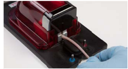
Figure 3-14 Aligning the tail

NOTE: The Tail Cover has magnets and alignment posts to ensure that the Tail Cover snaps into proper position.