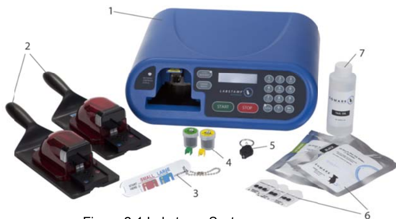
Figure 2-1 Labstamp System