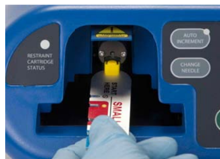
Figure 3-9 Tail Gauge Fork-End