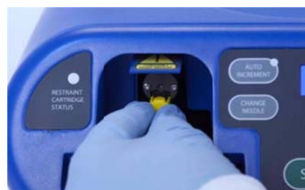
Figure 3-8 Install Needle Cartridge