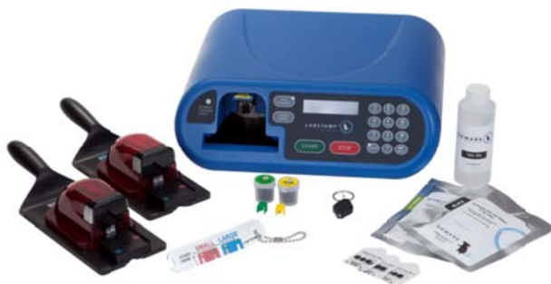
Figure 1-1 Labstamp System

Anesthesia is not required for using the Labstamp System. However, please defer to your Institutional Animal Care and Use Committee (IACUC), attending veterinarian and/or veterinary services for any animal welfare concerns.