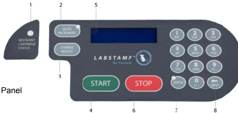
Figure 2-4 Control Panel