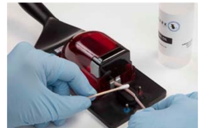
Figure 3-10 Apply Tail Oil