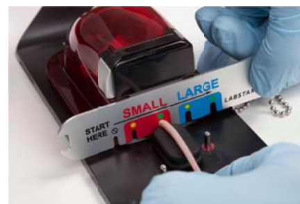
Figure 3-6 Positioning the Tail Gauge

IMPORTANT: If the tail is too large for any of the slots, the animal is too large to be tattooed.