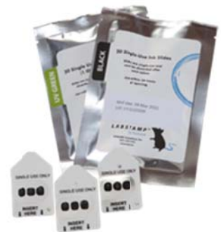
Figure 3-11 Ink Slide Pouch