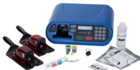
Figure 3-1 Labstamp System