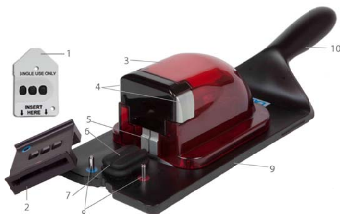
Figure 2-2 Restraint Cartridge Components