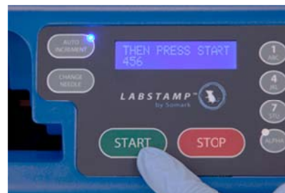
Figure 3-17 Start Button

NOTE: When the machine begins to tattoo, the RESTRAINT CARTRIDGE STATUS light will begin to flash red. Do not attempt to remove the Restraint Cartridge from the Applicator Machine while the light is flashing red.