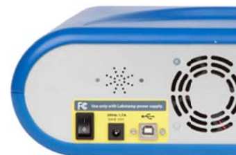
Figure 3-2 Power Switch