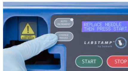
Figure 3-7 Change Needle Button