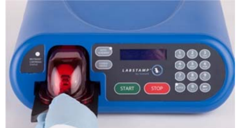
Figure 3-15 Load Restraint Cartridge